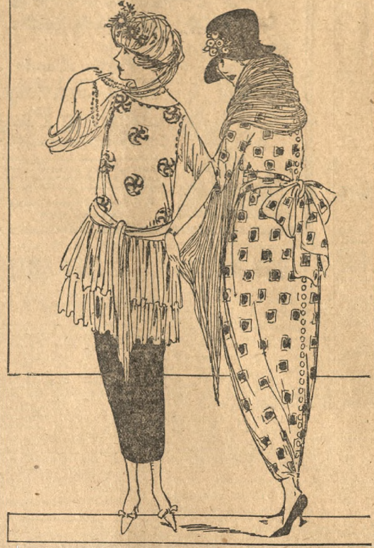
Here is Shown a Separate lunic Blouse of White Unifion Emproidered in Circles of Blue, With Two Ruffles of Plaited Chiffon Below the Waist. Sash and Skirt of Crepe de Chine.