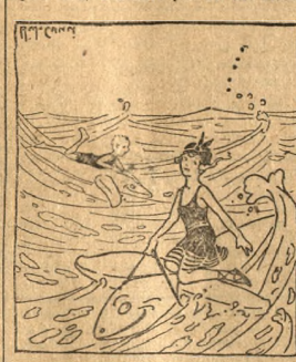
'What Fun It Is to Be a Sport Fish!"