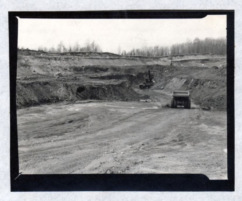
OHIO MINE - WEST PIT Looking West from 8400 W. Coordinate, Norwood Lease October - 1954