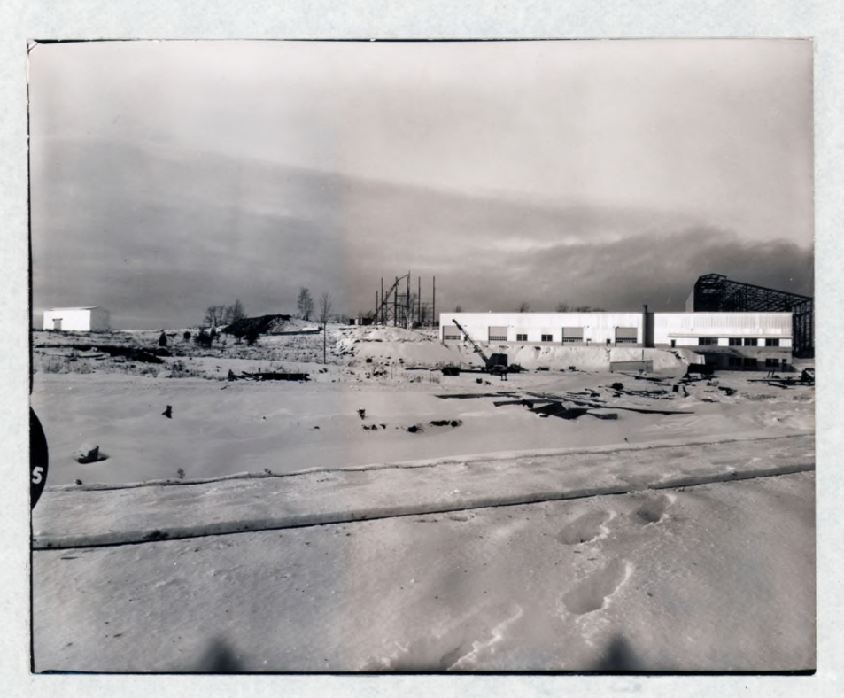
Republic Mine - December 1954 Looking North