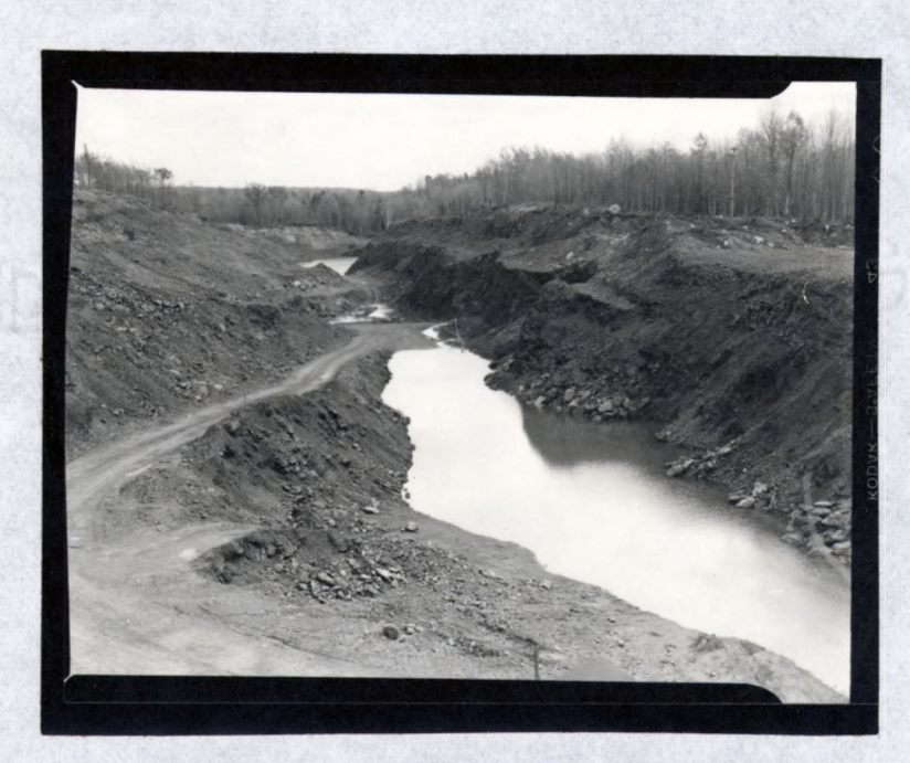
OHIO MINE - EAST PIT Looking East, Portland in foreground and Webster in background. October -- 1954