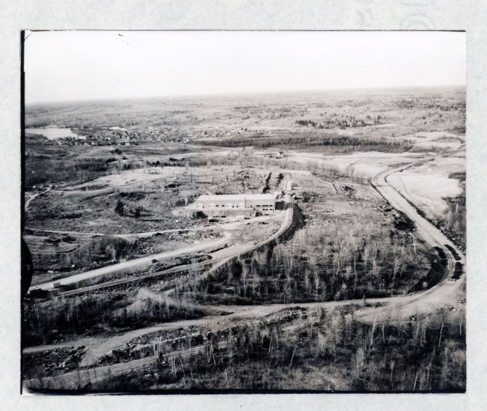
Republic Mine - April 1954 Looking North