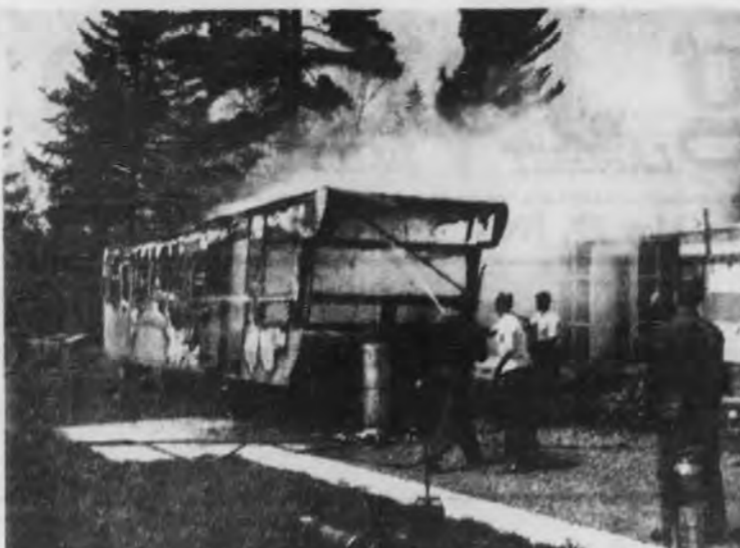
Volunteer firemen from Sands Township are shown battling the blaze which destroyed a trailer at the Pine Ridge Trailer Court yesterday afternoon. A woman escaped from the trailer moments before an explosion occurred in the front portion.