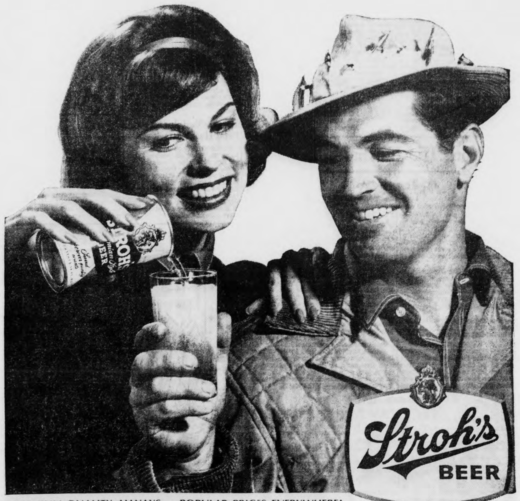
PREMIUM QUALITY ALWAYS...POPULAR PRICES EVERYWHERE!

Pleasure time...every time...enjoy a STROH'S Taste what fire-brewing does for beer flavor! It makes Stroh's smoother, more refreshing...light as a breeze that ripples your favorite fishing spot. Have a Stroh's, America's only fire-brewed beer. THE STROH BREWERY COMPANY, DETROIT 26, MICHIGAN