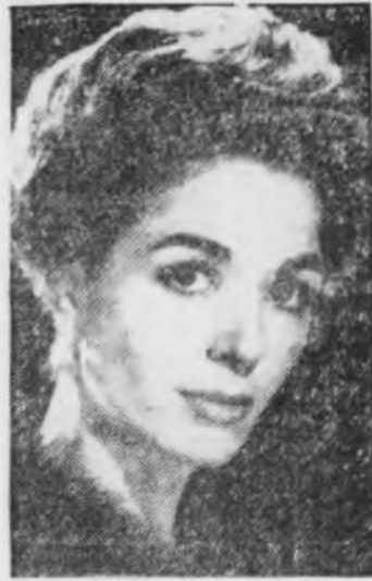
Dana Wynter plays the British Princess in "The List of Adrian Messenger."