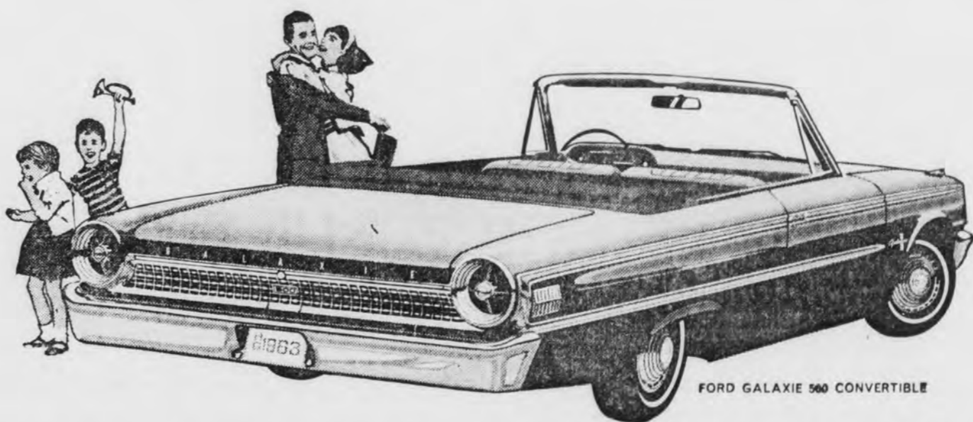
FORD GALAXIE 500 CONVERTIBLE

OUTSTANDING IN PERFORMANCE MOTOROLA STEREO AND T.V. SETS ERIKSSON RADIO & TV 107 N. 4th St. & 231 W. Washington