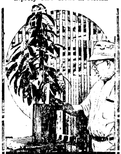
There is believed the leprosy cure... The United States... the best possible results.