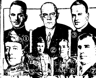
The delegates of the International Veterans Association (Fidac) who met in Rome, Italy, for the 12th Annual Legion Congress...