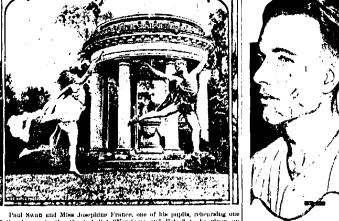
Rehearsing for a Greek Ballet. The scene shows a group of dancers in traditional Greek attire...