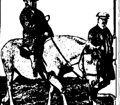
Mr. Premier Lloyd George's holiday in Scotland was spent at Blair Atholl, where he is taking his usual holiday...