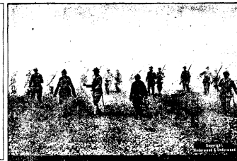
The remarkable photograph shows French troops advancing in the advance behind a heavy curtain of fire. The soldiers are moving forward in a line, with a heavy curtain of fire behind them. The photograph is a study of the history of the American Expeditionary Force.