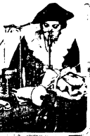
The work of the many factories of the United States has been greatly aided by the introduction of hand-cranked knitting machines which work on the principle of the sewing machine.