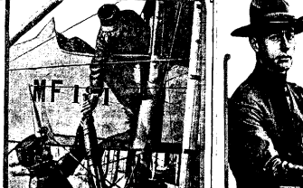
Biplanes being loaded with bombs in preparation for an aerial raid. The bombs are being loaded onto the aircraft, which will be used for an aerial raid. The photograph is a study of the history of the American Expeditionary Force.