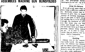
The soldiers have been trained for their efficiency and ability to handle the most intricate pieces of machinery in an unobstructed manner. The photograph is a study of the history of the American Expeditionary Force.