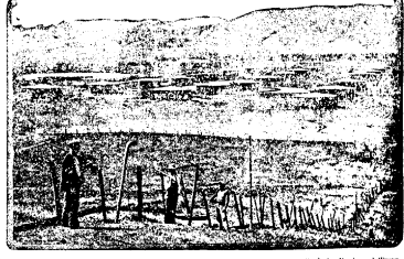
What is believed to have been an attempt to destroy the Jackson River tank, "burn" of the "Proletarian" Trust, is frustrated. The tank, which was destroyed by the Germans, was believed to have been destroyed by the Germans. The tank, which was destroyed by the Germans, was believed to have been destroyed by the Germans.