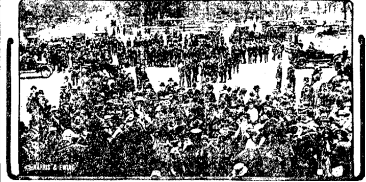
The police disperse a crowd of pacifists gathered in the public square. The crowd, which is full of pacifists, is dispersed by the police. The crowd, which is full of pacifists, is dispersed by the police.