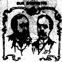
For President. BENJAMIN HARRISON. For Vice-President. WHITELAW REID.