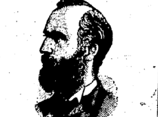
The People's Favorite.

Has the following famous many other lines of FINEST GOODS, which are well worth your notice: 25-inch CLOVELAND SUITINGS, all colors and mixtures, best value ever offered, 50c; 26-inch FLAXEN SUITINGS, in brown, and gray mixtures, 50c; 27-inch ENGLISH CASHMERE, leading colors, 50c; 28-inch Fancy striped and mixed SUITINGS, 50c; 26-inch TRICOT, in gray and brown mixtures, 40c and 50c; 26-inch all wool, Flannel and Tricot SUITINGS, 50c; 26-inch HART SUITINGS, in plain colors, 40c; 26-inch MEDINA SUITINGS, a large variety, all colors, 50c; 26-inch Silk-Flush HENRIETTAS, 75c; 40-inch Extra Fine HENRIETTAS, 75c; 26-inch HENRIETTAS, best imported, all colors, 1.00; 26-inch DRAP DIAGONALS, all the new shades, 60c; 22-inch Imported BROADCLOTH, 1.50 & 2.00