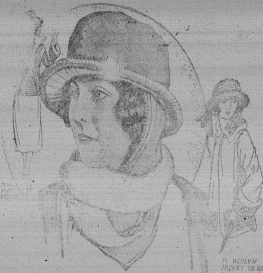
A WOOLEN TICKET TO BE KEPT WITH A KNITTED SKIRT.

S PRING, of all the reasons of the year, is the one which offers the most opportunity for the woman to show her taste and her sense of style. It is the time when she can discard the heavy, dark, and unbecoming winter wardrobe and replace it with the light, bright, and becoming spring wardrobe. The first day of spring is the ideal time to make this change, and the sports suit is the perfect garment for the occasion. The sports suit is a garment which is both practical and stylish. It is made of a soft, comfortable fabric, and it is designed to be worn over a matching skirt. It is a garment which is both practical and stylish. It is made of a soft, comfortable fabric, and it is designed to be worn over a matching skirt. It is a garment which is both practical and stylish. It is made of a soft, comfortable fabric, and it is designed to be worn over a matching skirt.