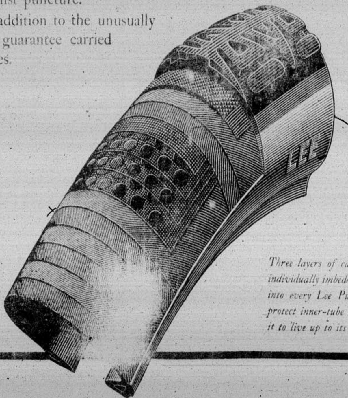
Three layers of case-hardened steel discs, individually imbedded in pure rubber, built into every Lee Puncture-proof Cord tire protect inner-tube and carcass, and enable it to live up to its name.

No matter what your service, the Lee Line of Pneumatic offers a tire for every purpose. Lee Fabric Tires, Lee Cords, Lee Puncture-proof Fabrics and—greatest of all—Lee Cord Puncture-proofs—the tire sensation of 1921.