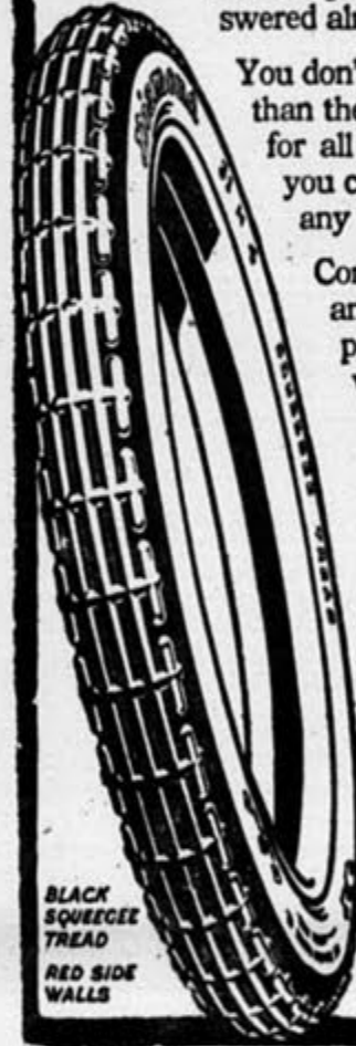
BLACK SQUEEZE TREAD RED SIDE WALLS