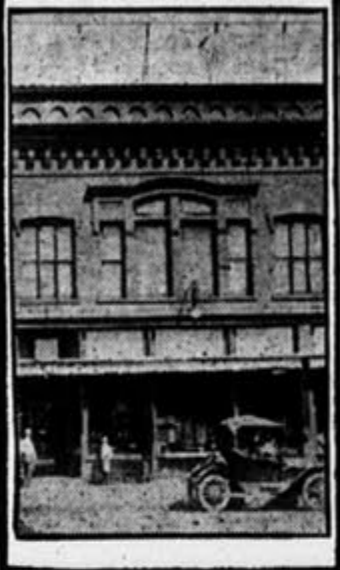
Delta Hardware Co.

T HIS may be a good deal like Abraham Lincoln's question: "How long should a man's legs be?" And it can be answered almost as shortly.