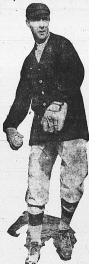
DICK RUDOLPH.

Pitcher Dick Rudolph is now the most talked of man in Boston National league baseball circles at present. The cause of all this chirping is due to the fact that Dick has been twirling consistently good ball for the Braves.