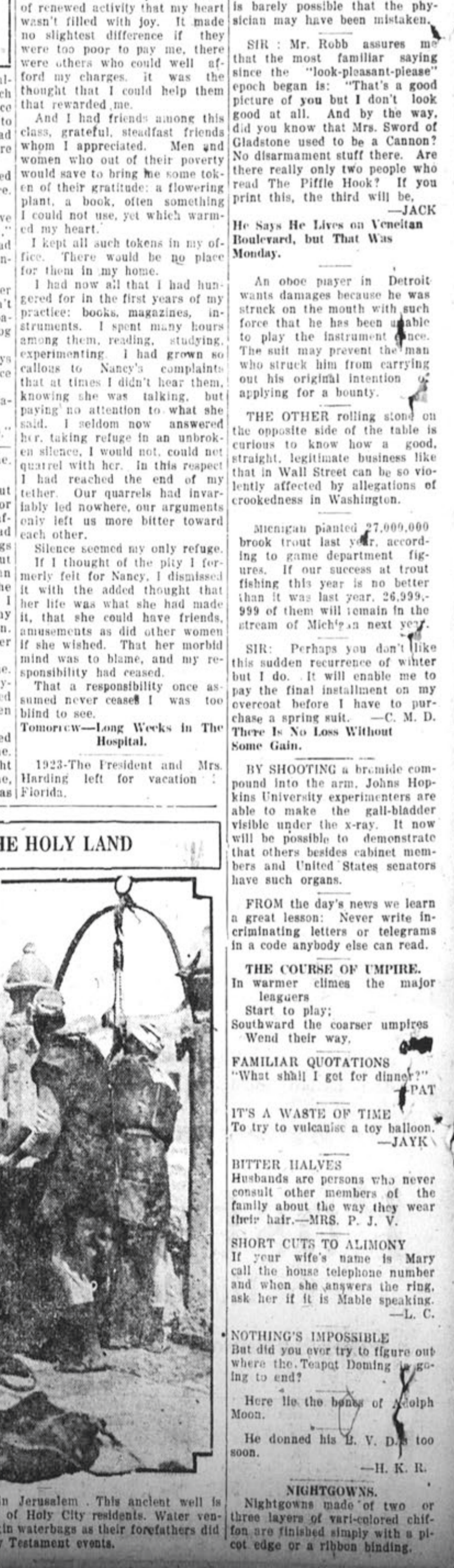
Site of Solomon's Temple in Jerusalem. This ancient well is still used to quench the thirst of Holy City residents. Water venders are shown filling goat-skin waterbags as their forefathers did in the days of the Old and New Testament events.