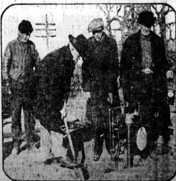
Cold weather and low gas pressure constitute a civic emergency, according to Mayor W. E. Nicodemus of Drumright, Okla. So he gathered a committee of citizens and tapped a private mine for general supply. Picture shows the committee at work, with the mayor second from the right.