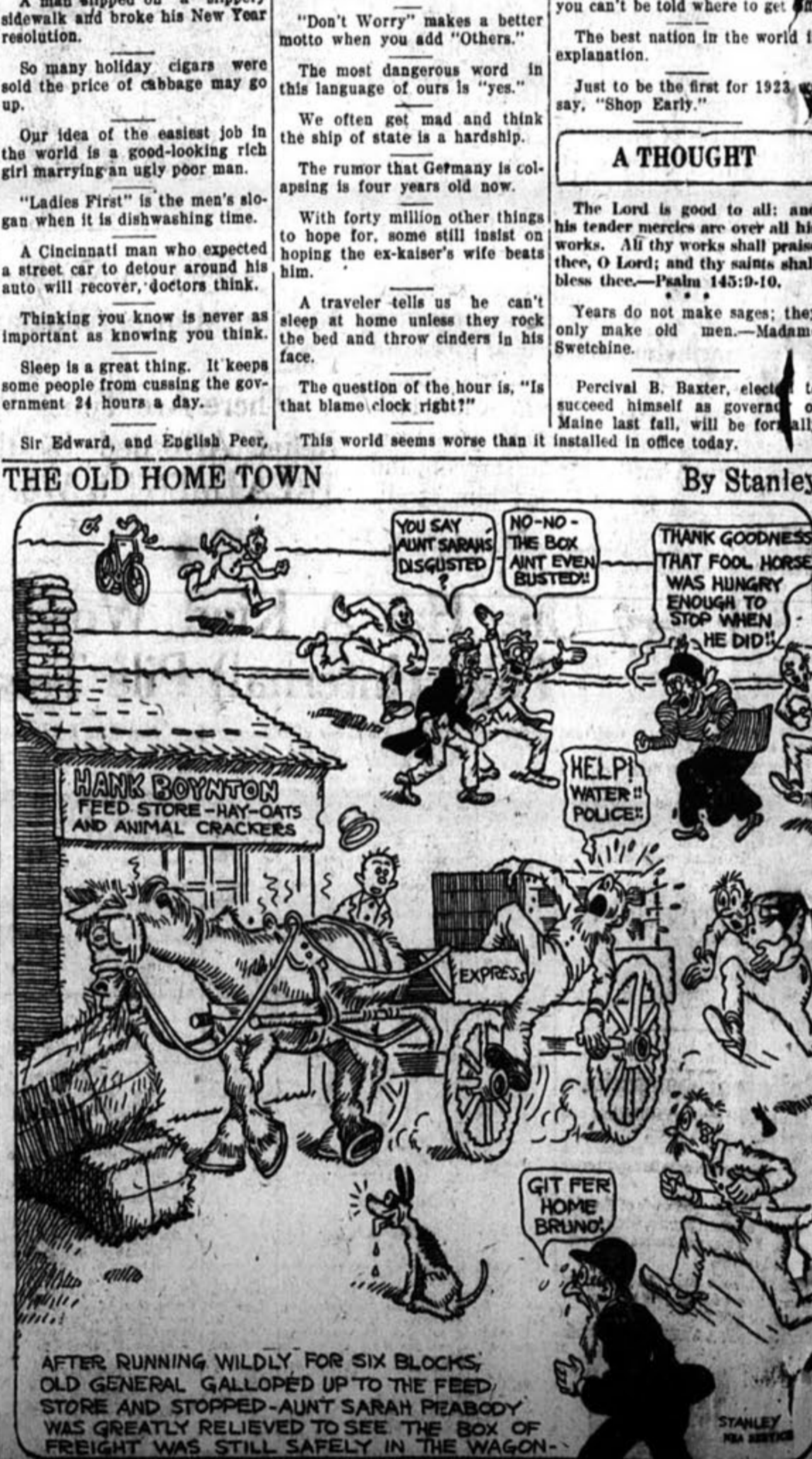
AFTER RUNNING WILDLY FOR SIX BLOCKS, OLD GENERAL GALLOPED UP TO THE FEED STORE AND STOPPED-AUNT SARAH PEABODY WAS GREATLY RELIEVED TO SEE THE BOX OF FREIGHT WAS STILL SAFELY IN THE WAGON.