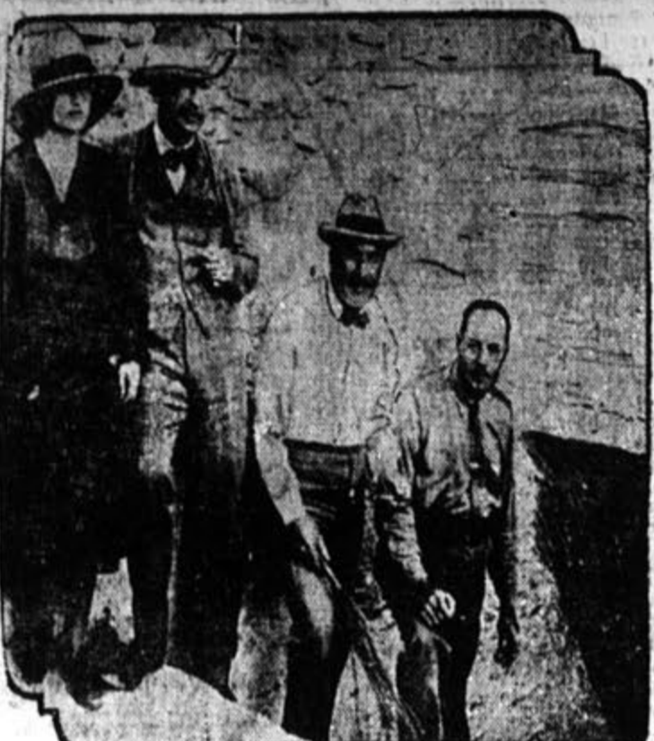
Lord Carnarvon, head of the archaeological expedition, which discovered in Egypt the tomb of King Titenkhamen with its wealth of buried treasure...