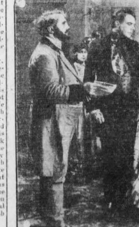
SCENE IN "THE WARRENS OF VIRGINIA," TO BE PRESENTED AT THE DEWITT THEATER TODAY.

Right now, when hay fever is attacking its victims and when asthma is causing so much distress, there is a demand for Foley's Honey and Tar Compound—the remedy that brought relief to thousands in previous years. Don't continue to suffer. It will help you. Contains no opiates. Sold everywhere.