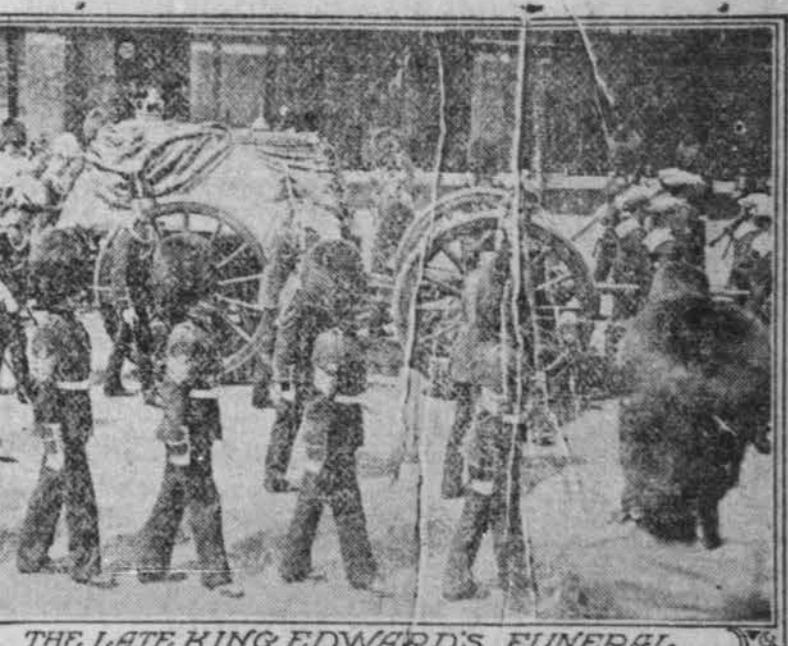
At Marquette Opera House Tonight.

PERFUMES FROM THE GARDEN. Scent making represents a favorite garden hobby of the moment. Few perfumes nowadays are made of a single flower. There may be a predominating note of yessobea or of carnations, but probably four or five different blossoms have gone to make up the result and the interest in making the extract at home lies in allaying one to another, experimenting with new combinations and aromas much as a chef toys with herbs and essences in the origination of a new sauce.