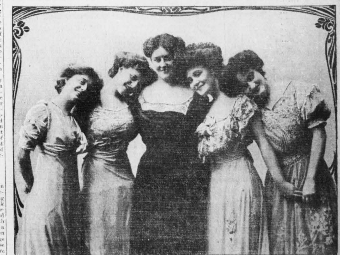
The five most beautiful women on the stage at the Marquette Opera House next Friday evening in "A Gentleman from Mississippi."

Marquette County Savings Bank Bldg. MICHIGAN. MARQUETTE