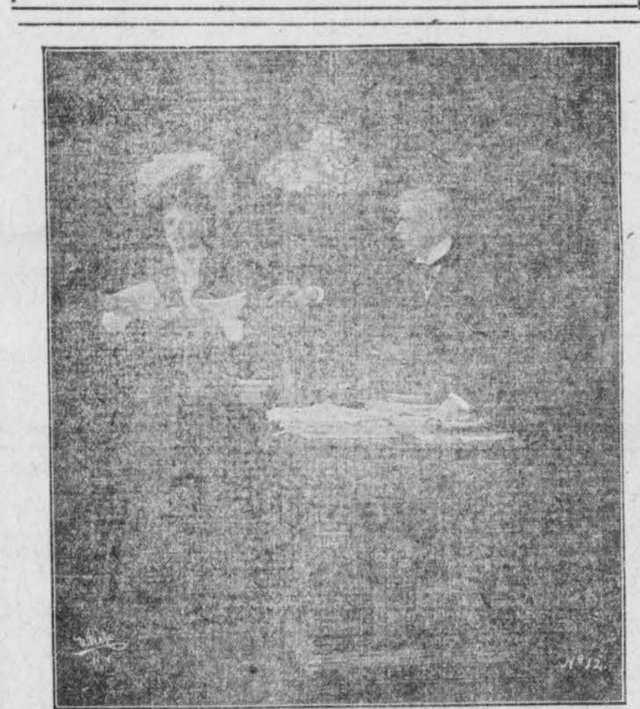
"The Discovery," Act II, "The Lion and the Mouse," the Mammoth Production. -