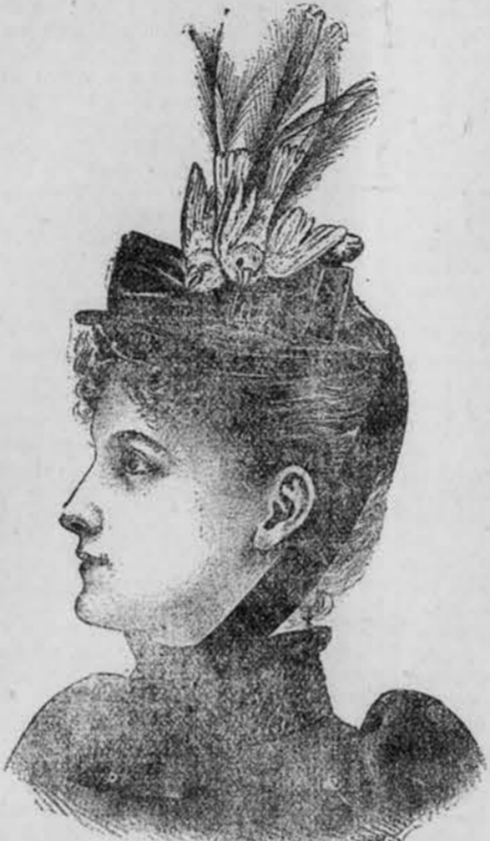
Harlow Block, Washington St.