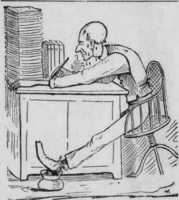
Department Clerk, Big Hat, Small Salary

This picture is after a celebrated painting in the Public Library and is generally supposed to represent a Department Clerk. It has, however, been ascertained that it was copied from a photograph of a Mining Journal reporter caught in the act of "writing up"